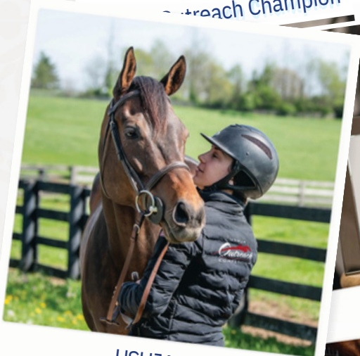
USHJA Outreach Champion