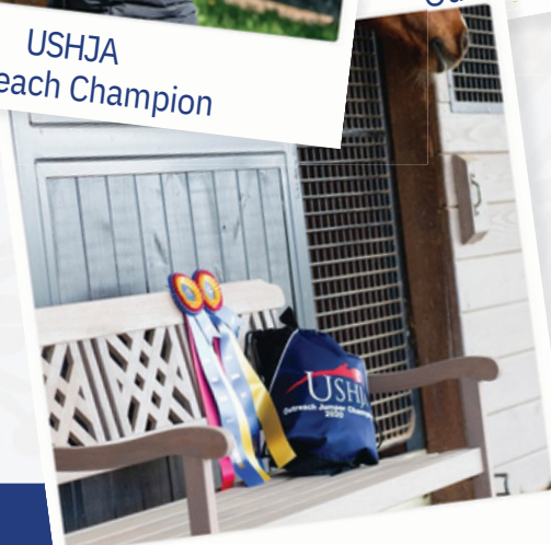
USHJA Outreach Champion