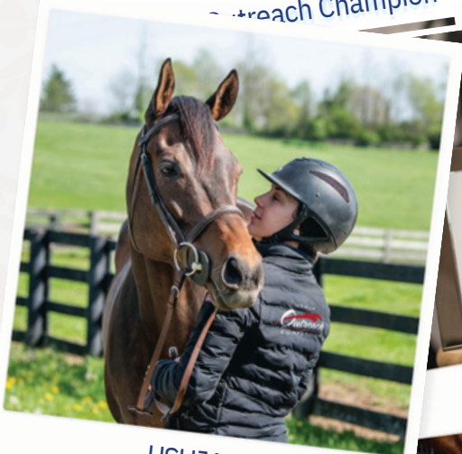
USHJA Outreach Champion