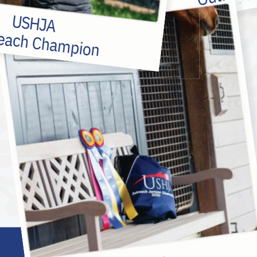
USHJA Outreach Champion