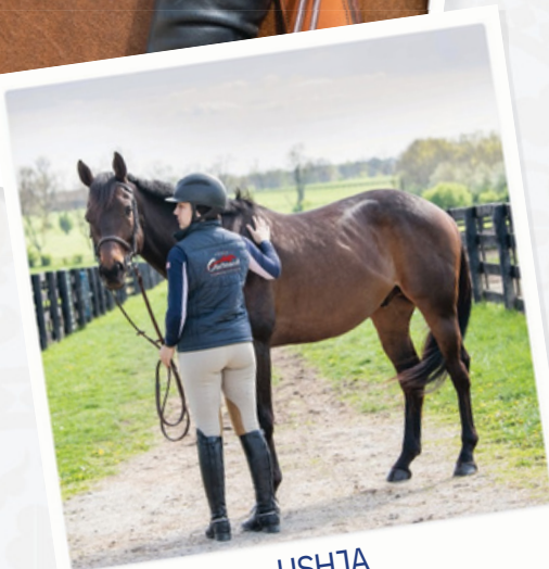
USHJA Outreach Champion