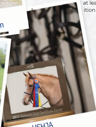
USHJA Outreach Champion