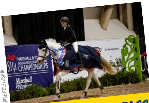
GOLDEN BACKSTAGE PASS